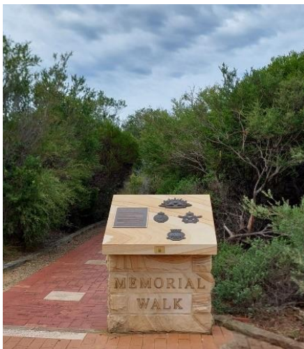
The rebuilt plinth

Please proceed along the pathway and we invite you to enjoy the peace and beauty of Australia's Memorial Walk.