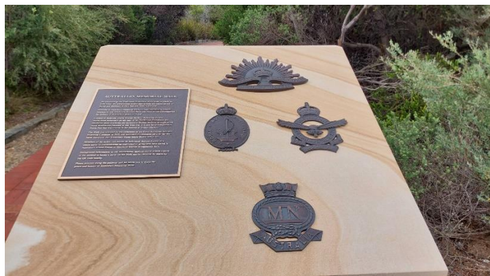
The 'desk' of the new plinth